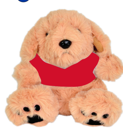
Sample of finished product. Approx. 30% size